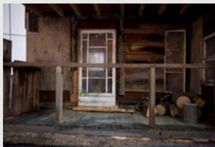
Ken Lum from shangri-la to shangri-la , 2010 (detail) site-specific installation in progress [LUM-05]