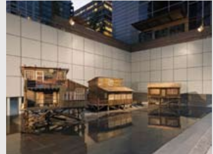
Ken Lum from shangri-la to shangri-la , 2010 site-specific installation [LUM-03]