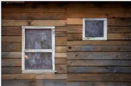
Ken Lum from shangri-la to shangri-la , 2010 (detail) site-specific installation in progress [LUM-04]