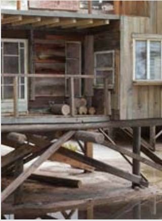
Ken Lum from shangri-la to shangri-la , 2010 (detail) site-specific installation Photo: Trevor Mills and Rachel Topham [LUM-01]