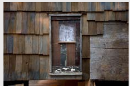
Ken Lum from shangri-la to shangri-la , 2010 (detail) site-specific installation in progress [LUM-06]