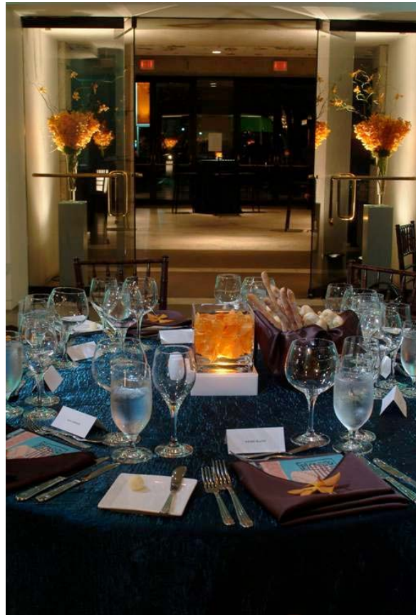
Event by MacGillivray & Associates Event Management

Catering, including food, bar service, flowers, music, and waste removal, are the responsibility of the event organizers and must be removed from the premises immediately following the event. All plant products must be treated with a pesticide before their arrival at the Gallery. Rentals to be placed in the lobby under the stairwell at the end of the event and must be removed by 9:00am the following day. Rental prices do not include food, beverage, music or equipment rentals such as tables, chairs, etc.