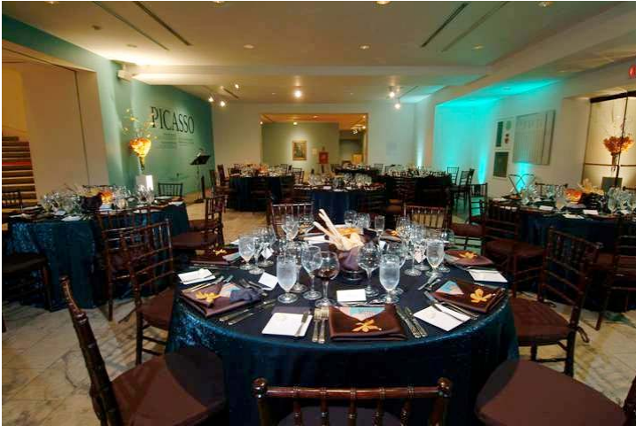
Event by MacGillivray & Associates Event Management

Rental of the Gallery does not include supplies, such as pens, pencils, photocopying, etc. Please be prepared to bring such items. A public phone is available in the lobby.